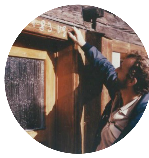
visible on many houses and more will probably be added in the coming years.

Every year on 31 December, as has been documented since 1832 in St. Niklaus and 1892 in Grächen, several 'musically equipped groups' go from door to door. Singing in defiance of the rain, snowstorm or icy cold, they wish everyone 'Good luck for the New Year ahead'. The singers delight with a unique Christmas, New Year or shepherd's song, accompanied by trumpets and clarinets. Local hospitality is also practised here and so it is possible that the singers will linger over a snack and a drink in one or other of the houses. Afterwards, the wish is confirmed with a handshake and a 'Happy New Year!'. As people leave their homes, blessing wishes are written in chalk above the main entrance. These are permanently