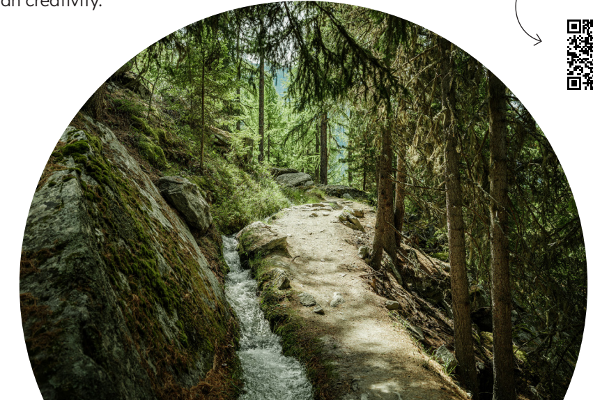
Tip Magic water circular tour Eggeri & Chilcheri